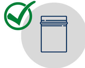
PLASTIC STORAGE BAG